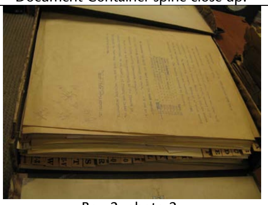
Box 2, photo 2.