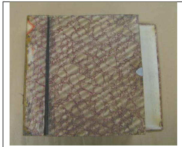
Document Container. Notice metal latch on right.

Photos of containers, papers and of processing the collection.