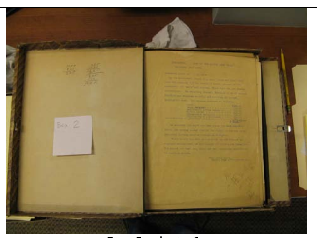
Box 2, photo 1.