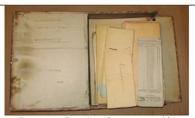
Document Container shown open with unorganized contents.